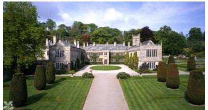
Lanhydrock House, Bodmin, Cornwall.

Lanhydrock is a magnificent late Victorian country house with extensive servants quarters, gardens and wooded estate.